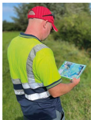
FIGURE 5. Private Group Scheme manager examining a pollutant-impact potential map on a catchment walk (Glinsk-Creggs)

The training addresses evaluation of raw water quality, delineation and characterisation of catchment areas and protection/mitigation strategies. This approach is welcomed by the EPA and is being implemented in a number of supplies around the country.