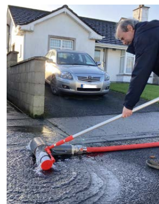
FIGURE 6. Sampling during a best practice demonstration of flushing of a group water scheme network.