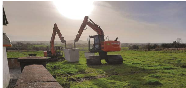
FIGURE 4. 2021 upgrade of Feigh East & West Private Group Scheme with a new chlorine contact tank