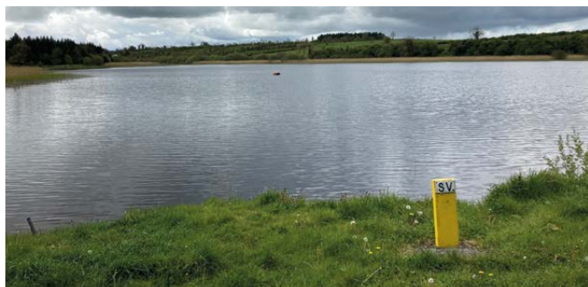
FIG. 1 Graddum Lough - Cavan, water source for Crosserlough (PGS) is to have source protection measures implemented.

The National Federation of Group Water Schemes (NFGWS) represents and works with the community-owned rural water services sector in Ireland. The NFGWS assists local authorities and individual group schemes identify and address water quality issues and risks.